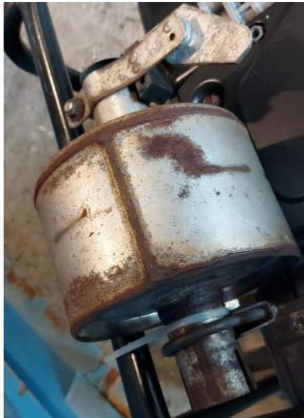
Donaldson Spark Arrestor M045123